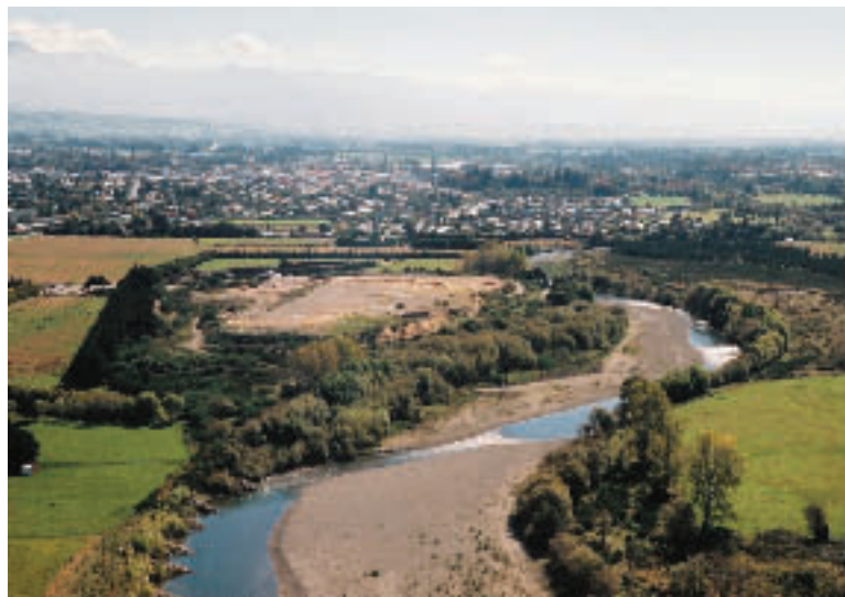
Masterton's landfill, on the banks of the Ruamahanga River, will close down by December 2006. After this, waste will be collected here and transported elsewhere for disposal, probably out of the region.

Consents for the plants serving Featherston and Masterton are under review and should be finalised within the next five years.