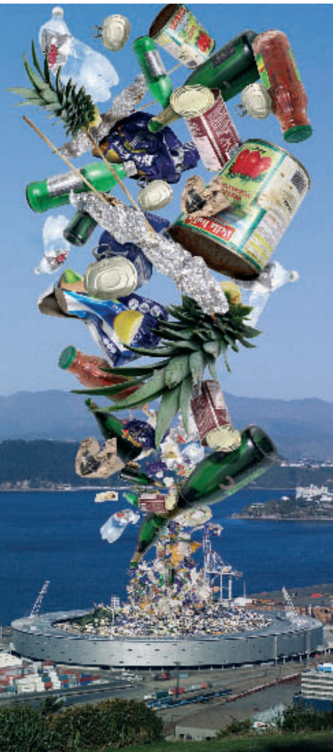
The rubbish put in the region's landfills in 2004 would nearly half fill the stadium. Up to 20 percent of this could have been diverted for composting or recycling.