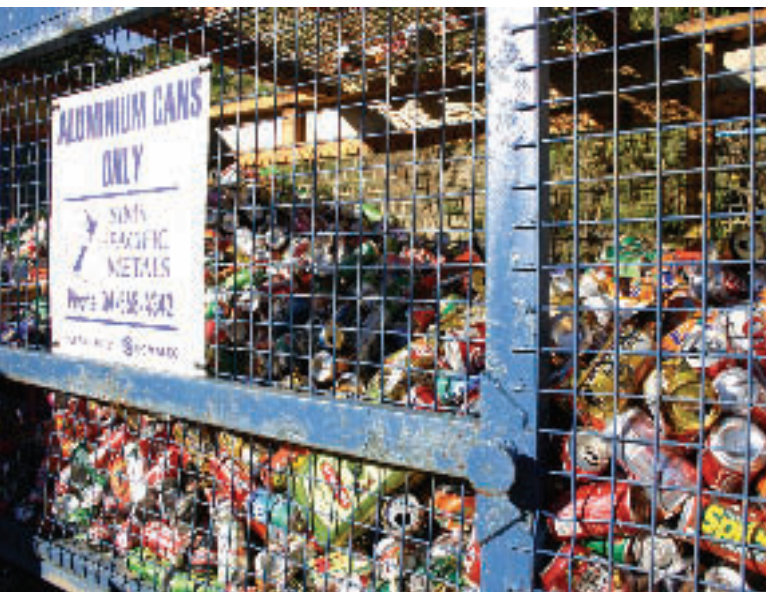
Since 1996, the number of cans sent for recycling in Wellington City has doubled from about 350 tonnes to just over 700 tonnes.

Overall, the total amount of waste sent to landfills has been falling each year, except at Wainuiomata and Silverstream landfills.