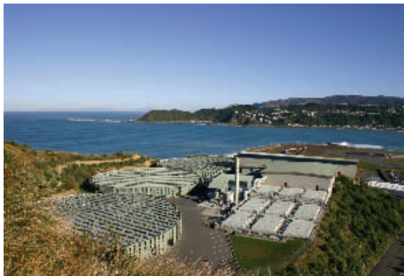
Wellington City Council’s sewage treatment plant at Moa Point near Wellington serves a population of about 130,000. The sewage is treated by screens, aerated tanks, bioreactors, clarifiers and finally ultra violet light for disinfection. The treated effluent is discharged from a 1.8 km outfall into Cook Strait.

Sewage effluent is by far the biggest proportion of liquid waste in the region. Almost all of it – 94 per cent – is discharged to coastal or fresh water. The nitrogen load on the Ruamahanga River from sewage adds up to around 74 tonnes per year, most of it (58 tonnes) coming from the Masterton plant. Each summer since 2003-04, the Carterton plant has discharged to land, reducing the nitrogen load on the river by nearly four tonnes a year.