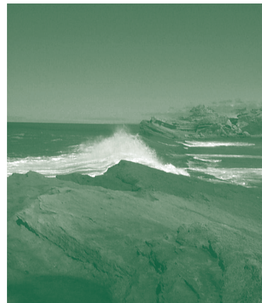
A wave overtops the reef and popular fishing platform at Castlepoint

For more information on what you can do contact Greater Wellington, or your local council or consult the Wairarapa Coastal Strategy document entitled Caring for our coast – a guide for coastal visitors, residents and developers . Included in these guidelines are more detail and advice on reducing the risk from hazards and carrying out hazard assessments