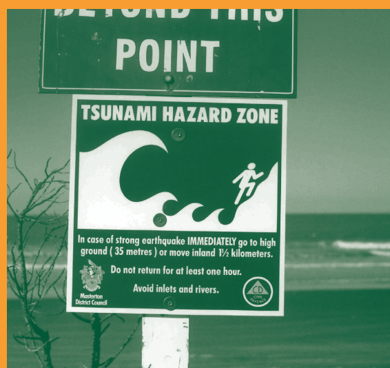
Signs like this have been placed around the Wairarapa coast warning people of the tsunami dangers and advising what to do when you feel an earthquake.