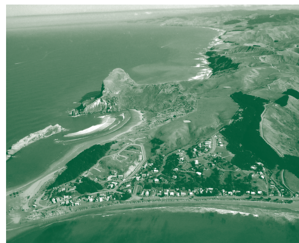
Ngawi and Castlepoint are two of the Wairarapa communities vulnerable to tsunami due to their relatively low elevation and exposure to tsunami generating sources.