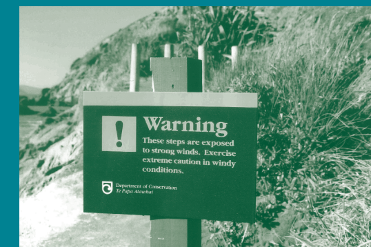
Watch out for signs like these warning people of the hazards associated with recreation on the coast.