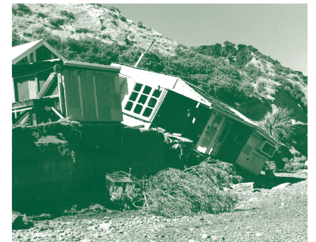
A Palliser Bay house claimed by the sea.

To minimise the risk, don't locate any valuable permanent assets too close to the water, and consult your local council for information related to coastal erosion for your property.