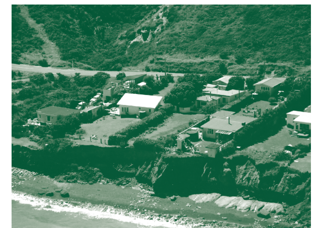
Cape Palliser Road and several houses have been lost to the sea due to erosion in eastern Palliser Bay.