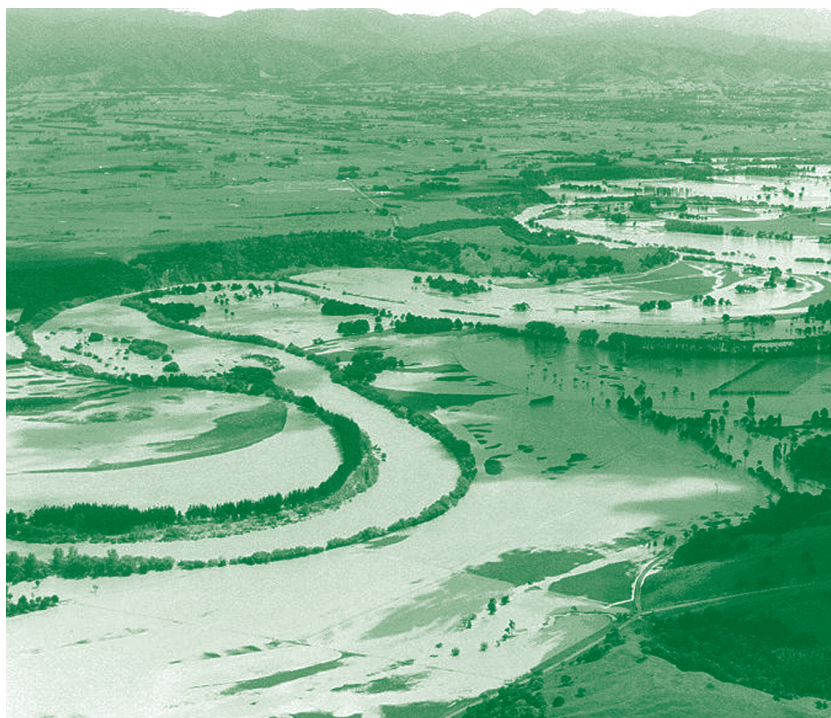
Flooding on the Ruamahanga River at Morrisons Bush east of Greytown.

Wairarapa Engineering Lifelines Association, 2003. Wairarapa Engineering Lifelines Project – Risk to lifelines from natural hazards. WELA, Masterton. (Contact: Hazards section of Greater Wellington – Regional Council, Wairarapa Division, Masterton).