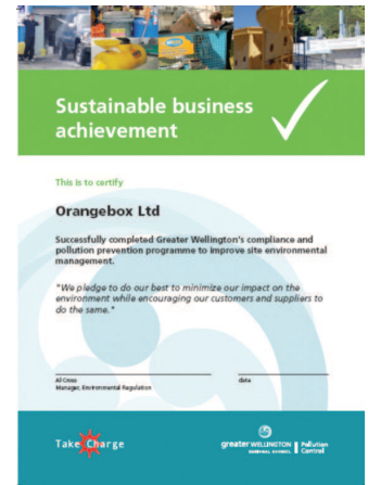
Figure 3: Sustainable Business Achievement certificate