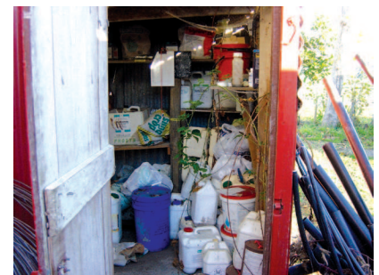
Figures 4 & 5: Unwanted agrichemicals being collected from Kapiti