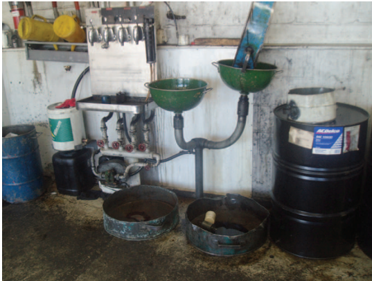
Figure 2: A waste oil collection system at a Wairarapa Service station

In 2007/08 the Environmental Protection Team recommenced Take Charge audits in the Wairarapa, making follow up visits to service stations which were initially visited in 2004, in order to ensure that all necessary site improvements had been carried out. Many of the required actions focused on making improvements to the storage and disposal of hydrocarbons (see Figure 2). Two service stations successfully completed the Take Charge programme in 2007/08.