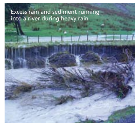
Excess rain and sediment running into a river during heavy rain

Some coastal areas act as sediment traps and cop it worse than others. These tend to be estuaries, harbours,