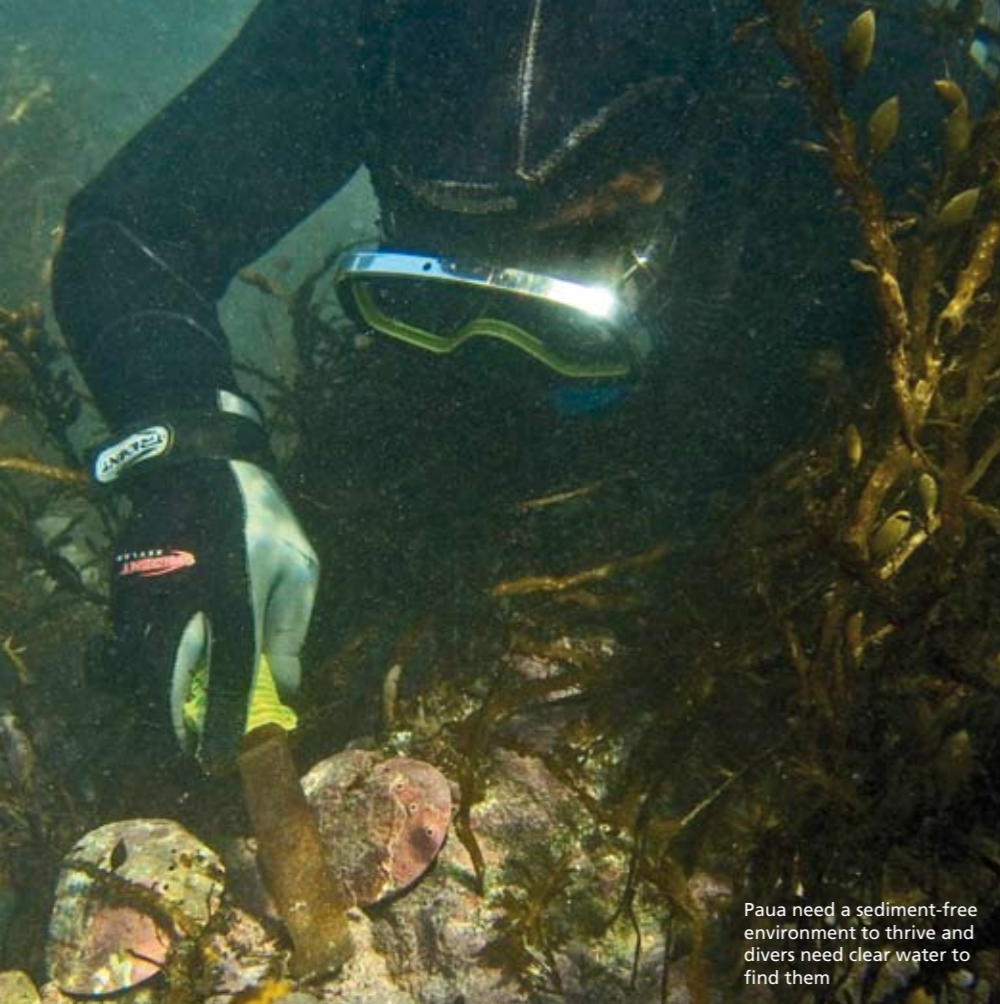
Paua need a sediment-free environment to thrive and divers need clear water to find them