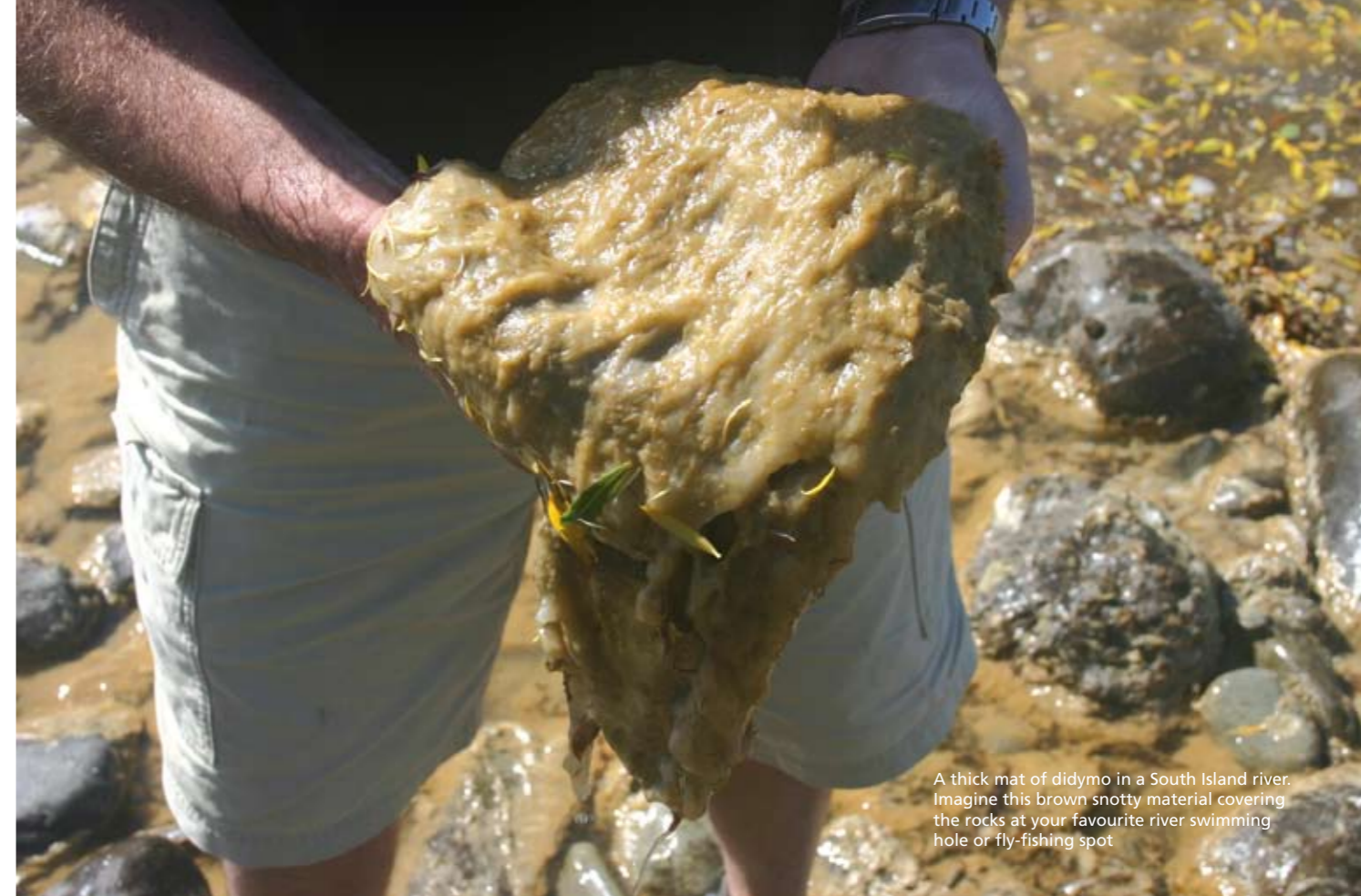
A thick mat of didymo in a South Island river. Imagine this brown snotty material covering the rocks at your favourite river swimming hole or fly-fishing spot

Further information about the Afforestation Grant Scheme contact: Ministry of Agriculture and Forestry, PO Box 2526, Wellington 0800 CLIMATE (254 628) climatechange@maf.govt.nz www.maf.govt.nz/climatechange