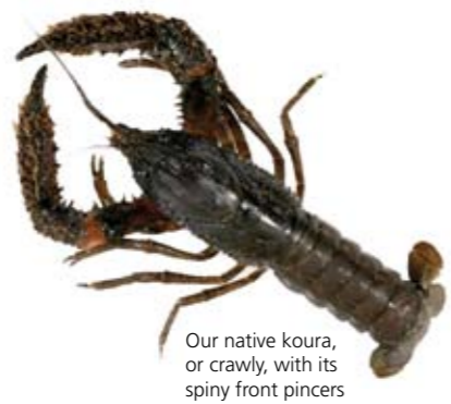
Our native koura, or crawly, with its spiny front pincers

Marron are similar to appearance to native koura only they can grow