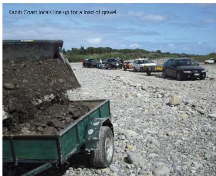
Kapiti Coast locals line up for a load of gravel

Gravel grab events are run in the Hutt and Kapiti Coast rivers to give people an opportunity to some gravel for around the home and to help explain why Greater Wellington takes gravel out of specific parts of a river system to help manage the risk of flooding and erosion.