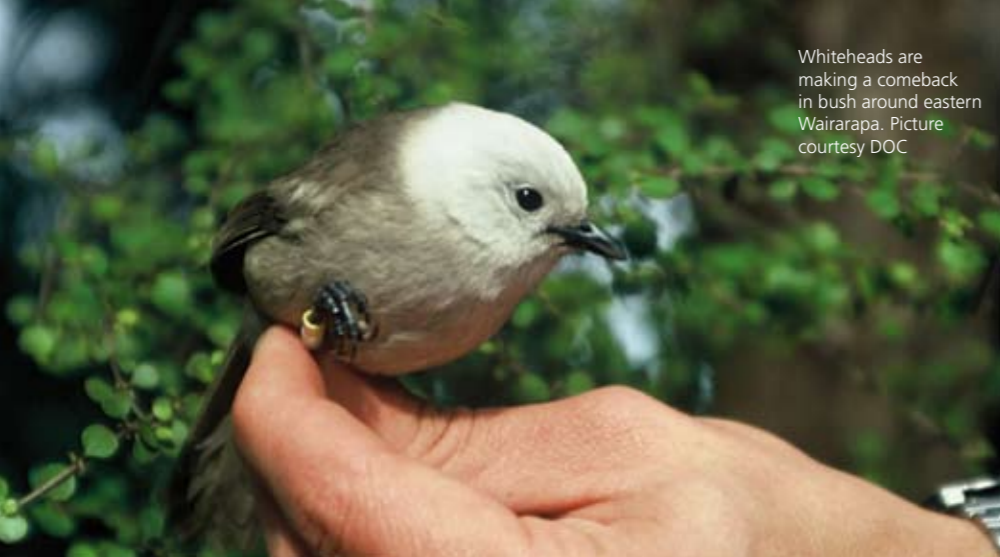
Whiteheads are making a comeback in bush around eastern Wairarapa.