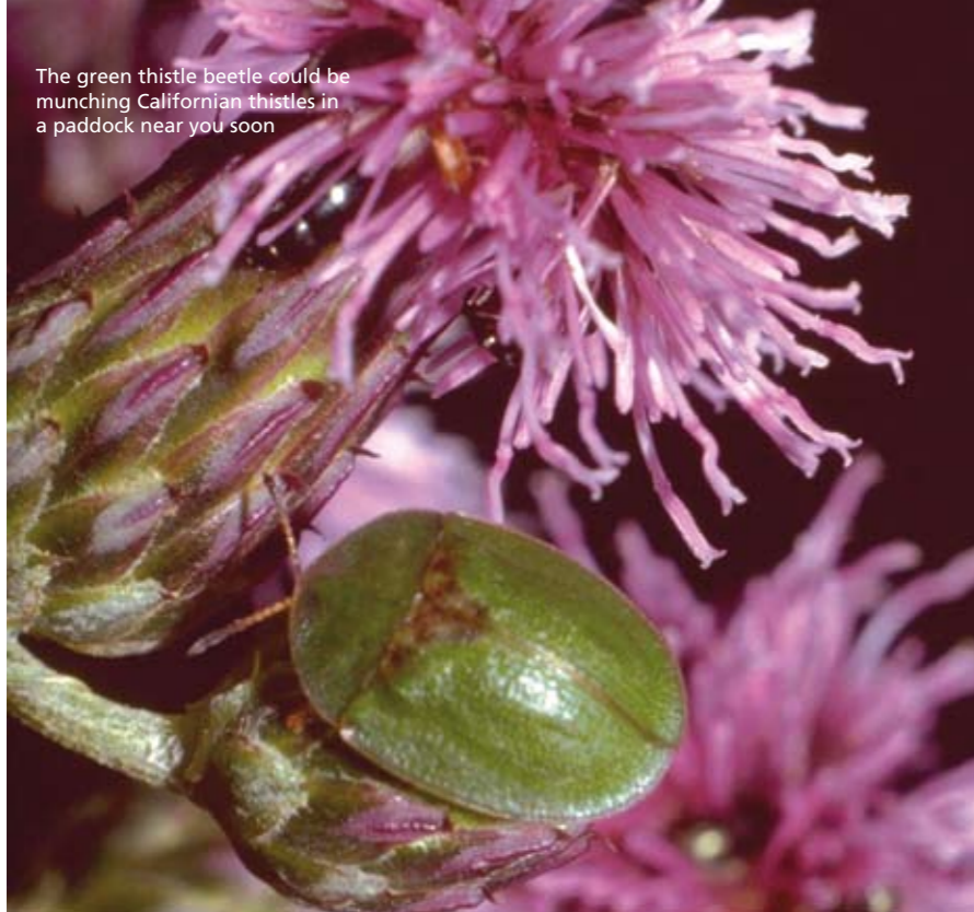
The green thistle beetle could be munching Californian thistles in a paddock near you soon