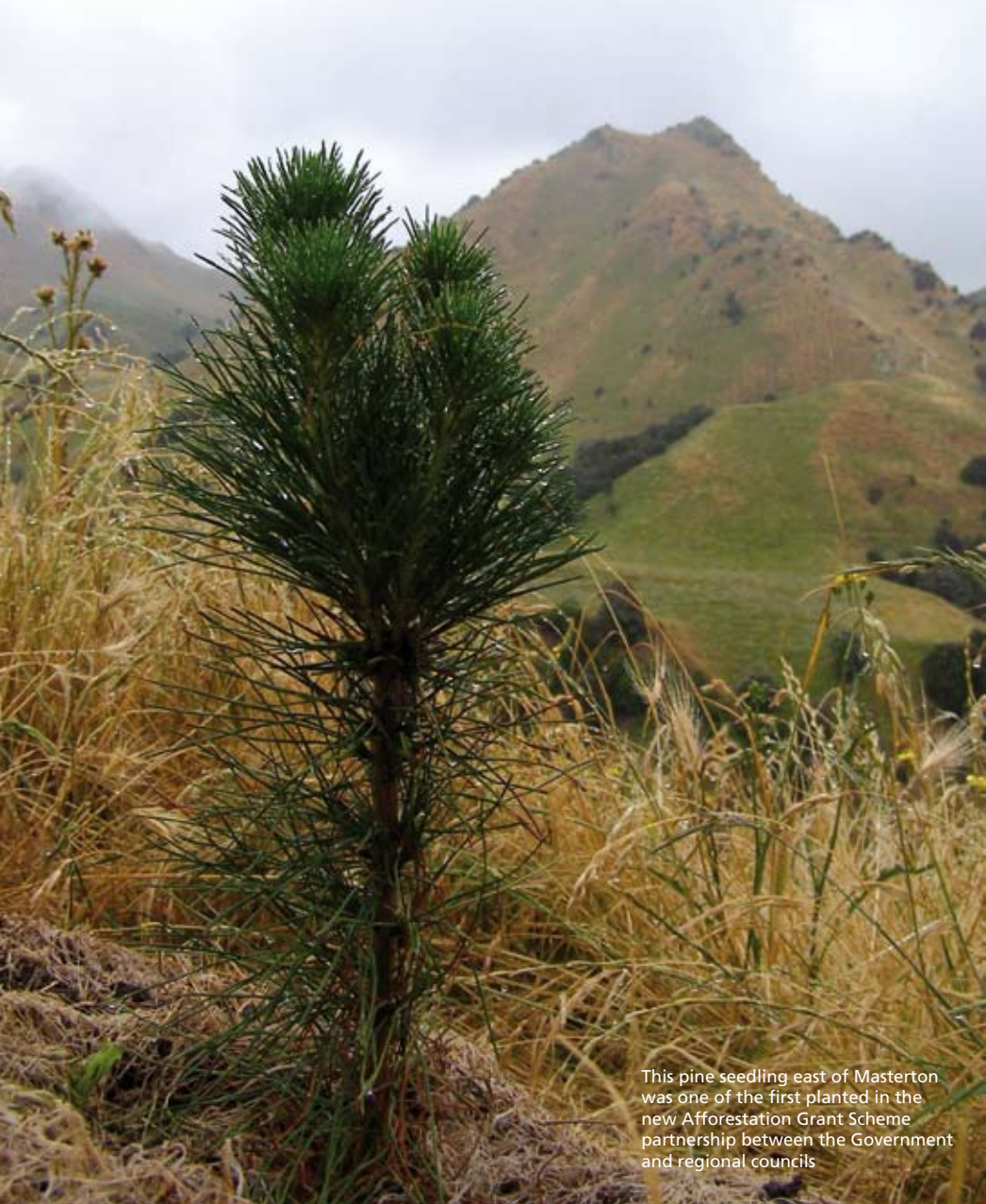
This pine seedling east of Masterton was one of the first planted in the new Afforestation Grant Scheme partnership between the Government and regional councils