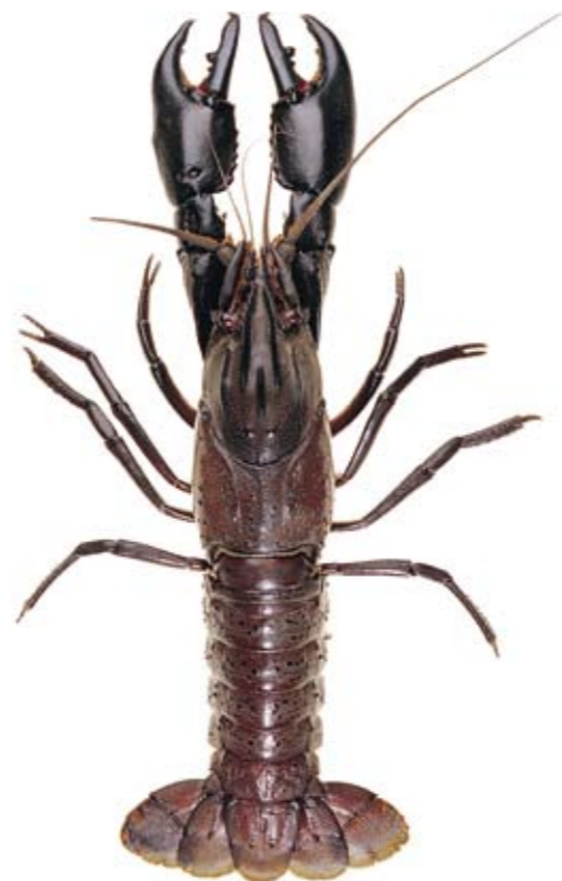
The Australian freshwater marron with its smooth front pincers

For further information on marron, visit: www.biosecurity.govt.nz/pests/marron