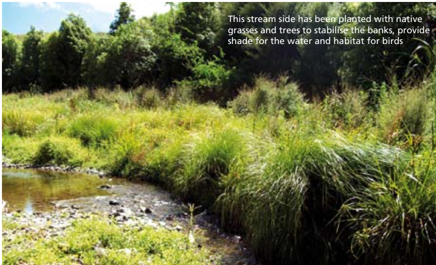
This stream side has been planted with native grasses and trees to stabilise the banks, provide shade for the water and habitat for birds