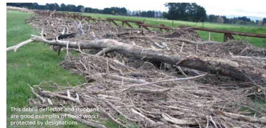
This debris deflector and stopbank are good examples of flood works protected by designations

The designations define areas where Greater Wellington can carry out and maintain its flood protection works without requiring a land use consent from the district council. They also give the landowner certainty by defining the area of their land required for flood protection purposes.