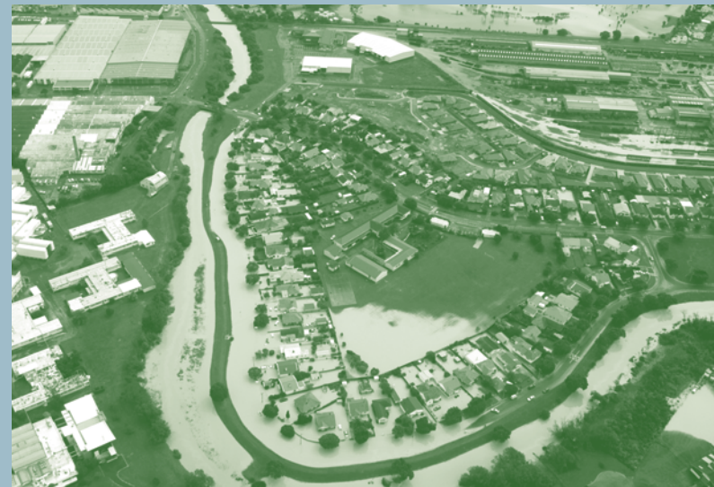
Flooding at Riverside Drive from the Waiwhetu Stream, 15-16 February 2004