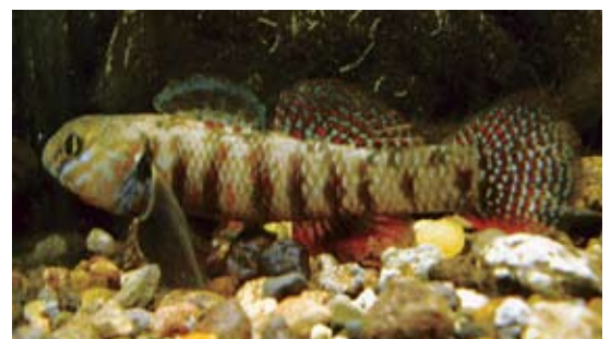
Male redfin bully