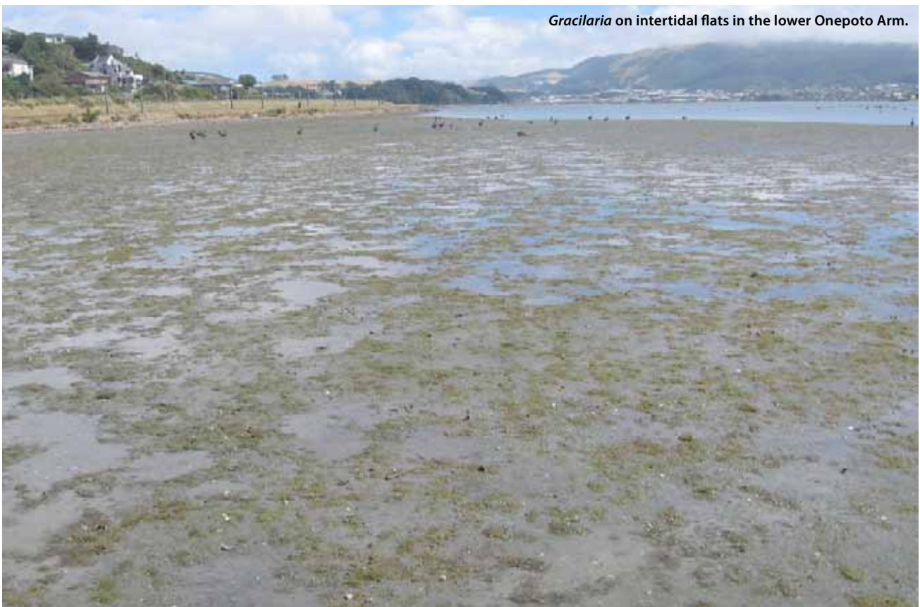
Gracilaria on intertidal flats in the lower Onepoto Arm.