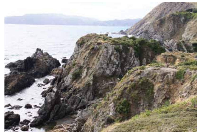
Te Pa o Kapo is a Ngāti Ira pa abandoned around 1820.

Waikekeno is a well preserved archaeological complex, including papa kāinga, gardens and pā. The garden system has high archaeological values as the size of the walls and mounds are rare. No systematic archaeological investigation has occurred here, so there is immense potential for information.