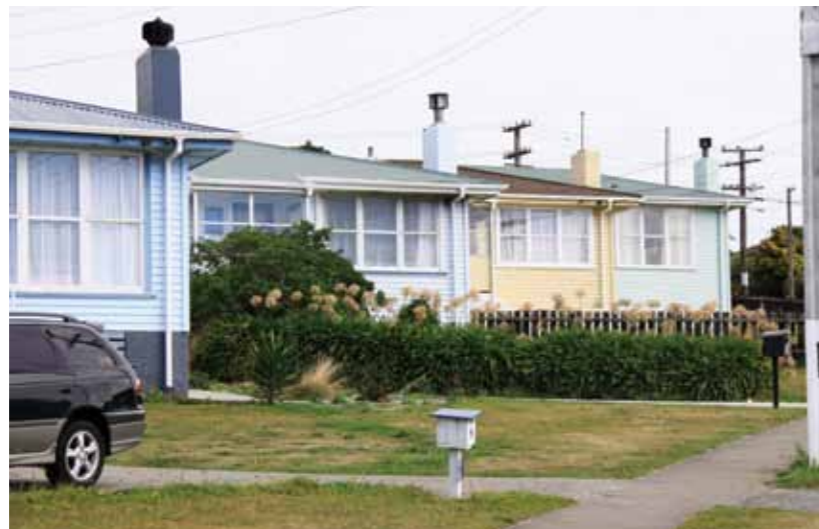
The Austrian State Houses in Titahi Bay, Porirua, illustrate suburban development of a particular era. Designed in New Zealand, they were built by Austrian tradesmen from materials pre-cut in Austria to address the housing shortage in the 1950s.