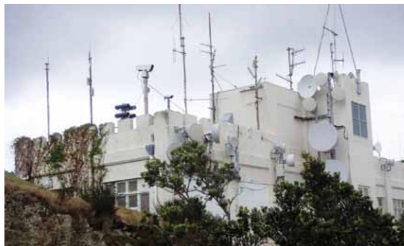
Built in 1927, the Former 2YA Transmitter Building was New Zealand's first major radio transmitter. The building is associated with the historic themes of communications and technology, and is still in use as a radio transmitter.