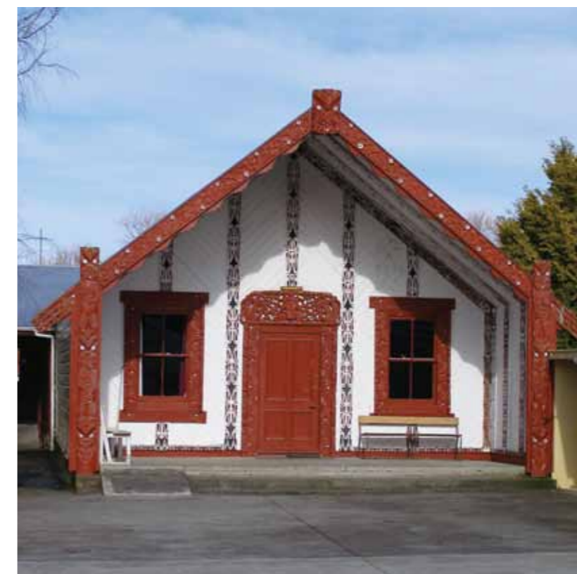
Papawai Marae , near Greytown, was the centre of Kotahitanga, the Māori parliament movement. Sessions in 1897 and 1898 passed resolutions to end Māori land sales.