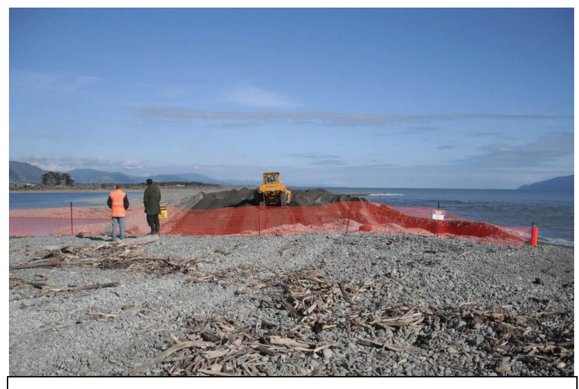
20 Initial cut