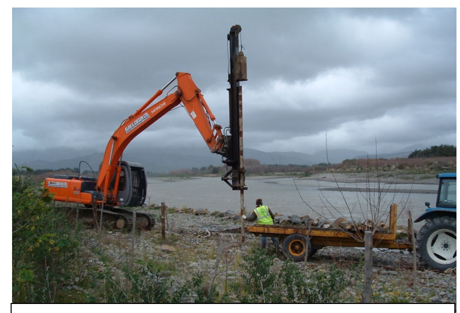
7 Debris Fence construction (driving irons)