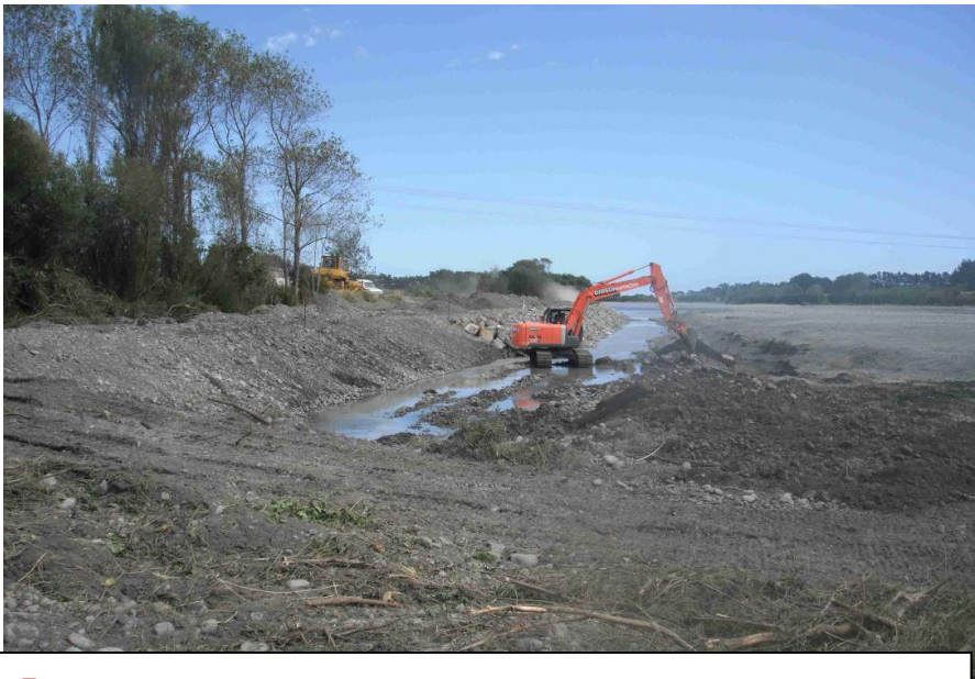
5 Rockline construction (Lethbridge – XS 220 to XS 240 approx)