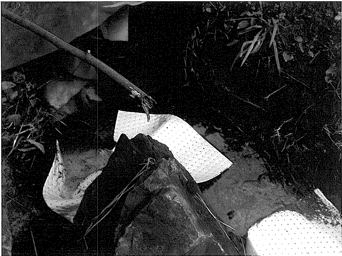
Pictures 1 & 2 showing results of the district council's stormwater upgrade Toxic spill July 2015