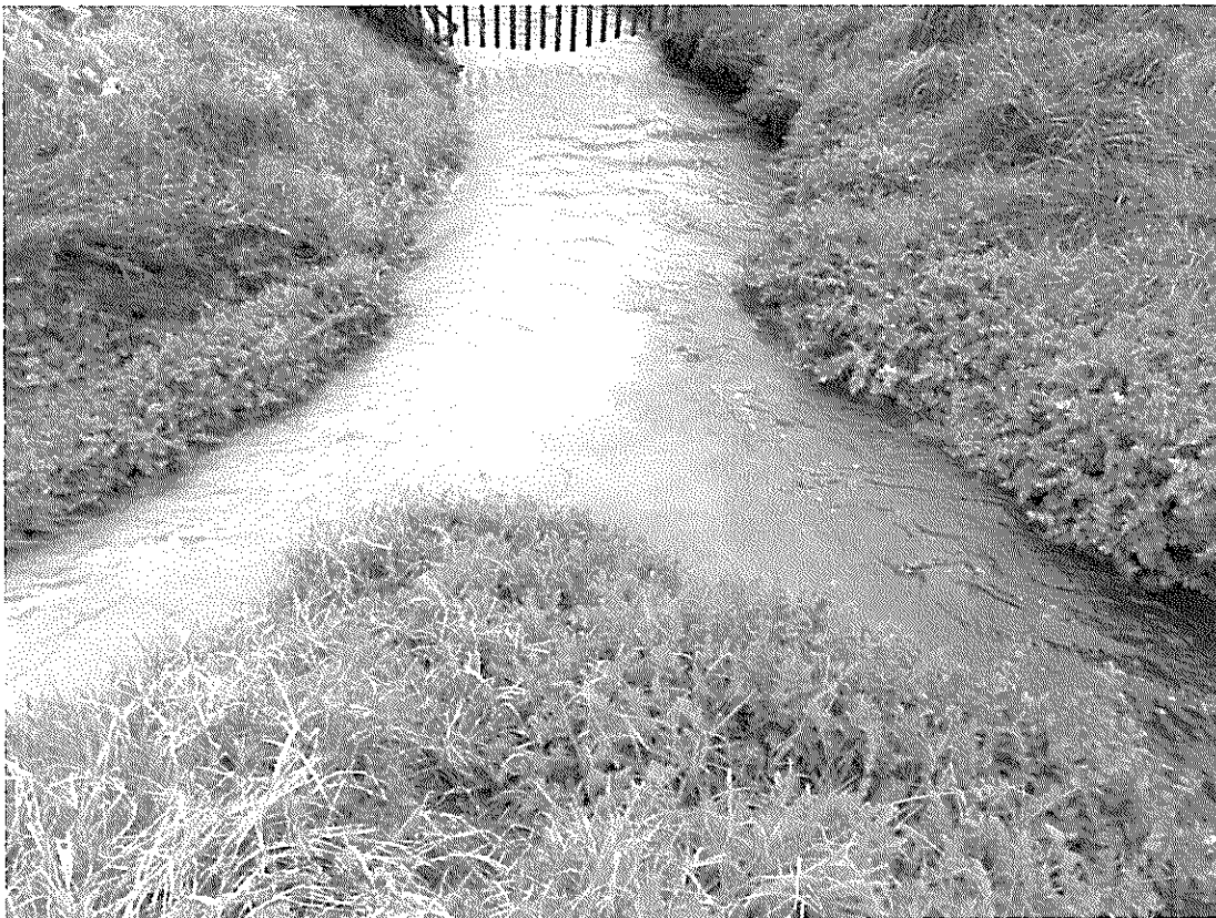
Sedimentation in Te Puka Stream (Wainui Stream tributary) from Transmission Gully. August 2015