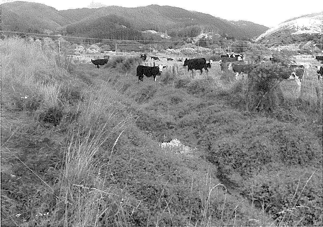
Stock in Wainui Stream mid 2015.