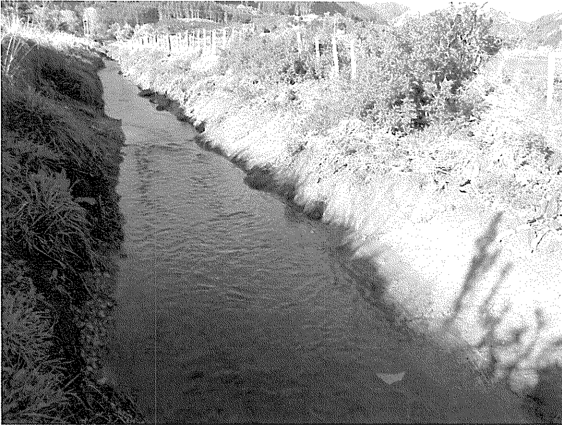
Illegal dredging May 2015. Carried out in the name of "drain clearing".