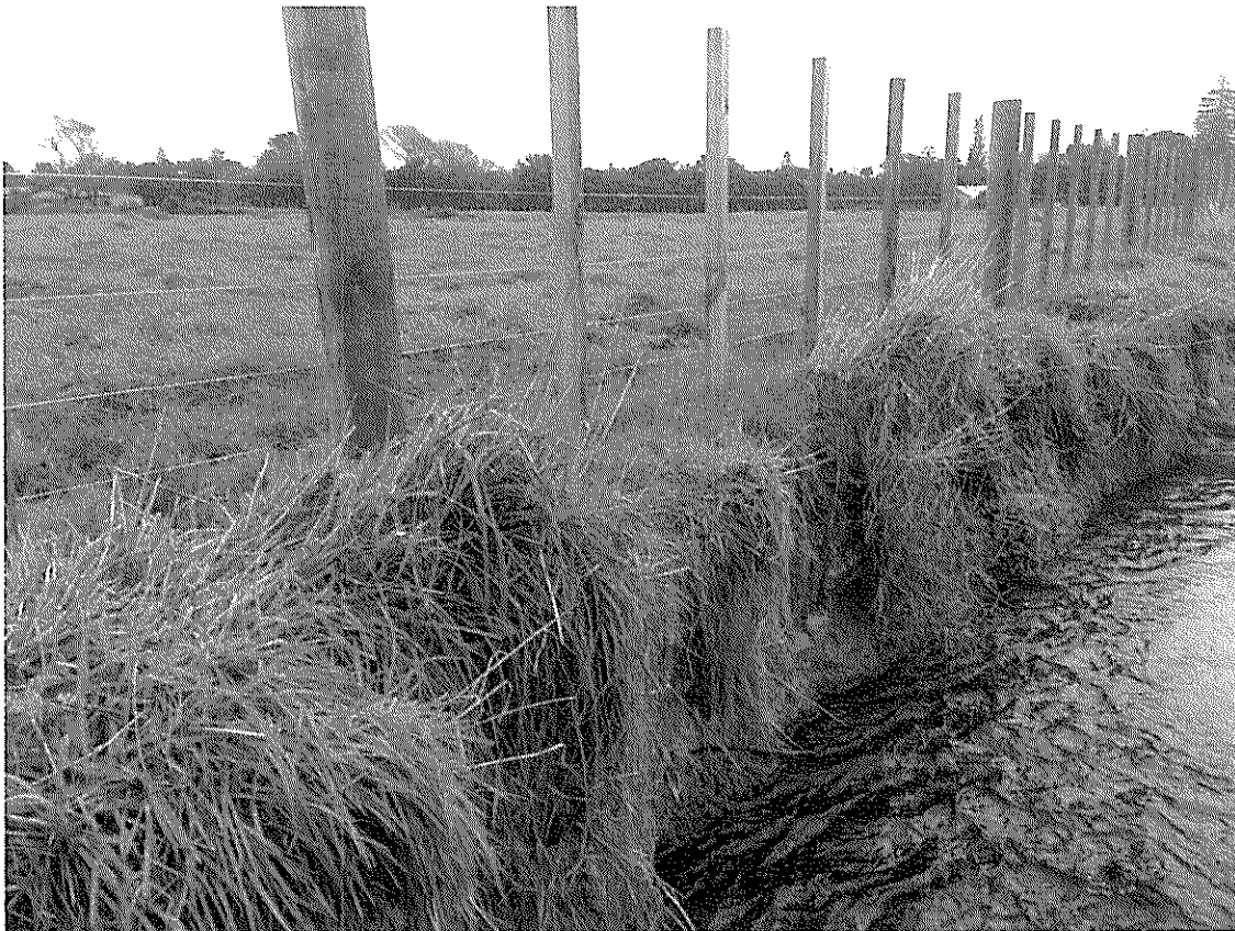
New fence placed so close to the stream it's nearly falling into it. July 2015