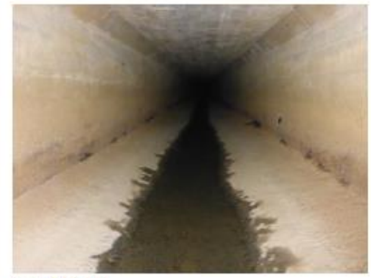
302 The Parade