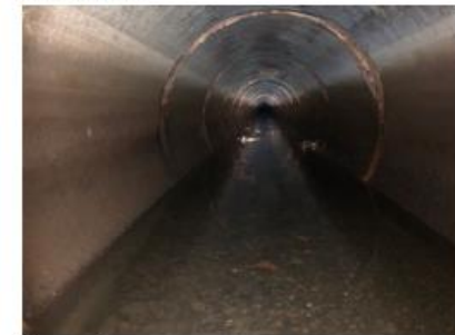
Miramar - Shops