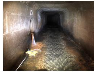
The Parade – Dover St