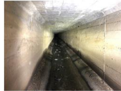
348 The Parade