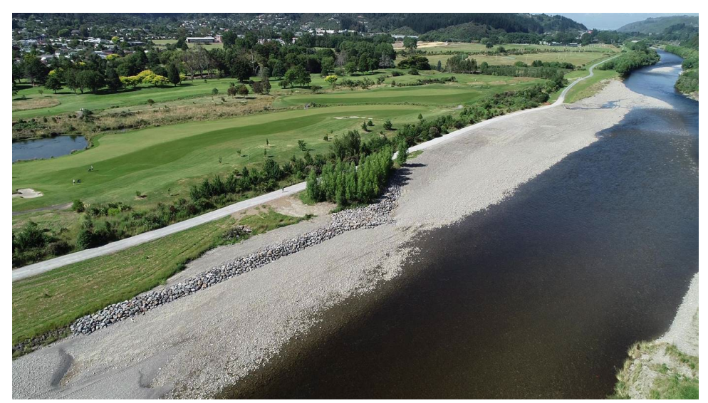
Figure 3: Royal Wellington Golf Club (South) Erosion Protection - Completed Mahi