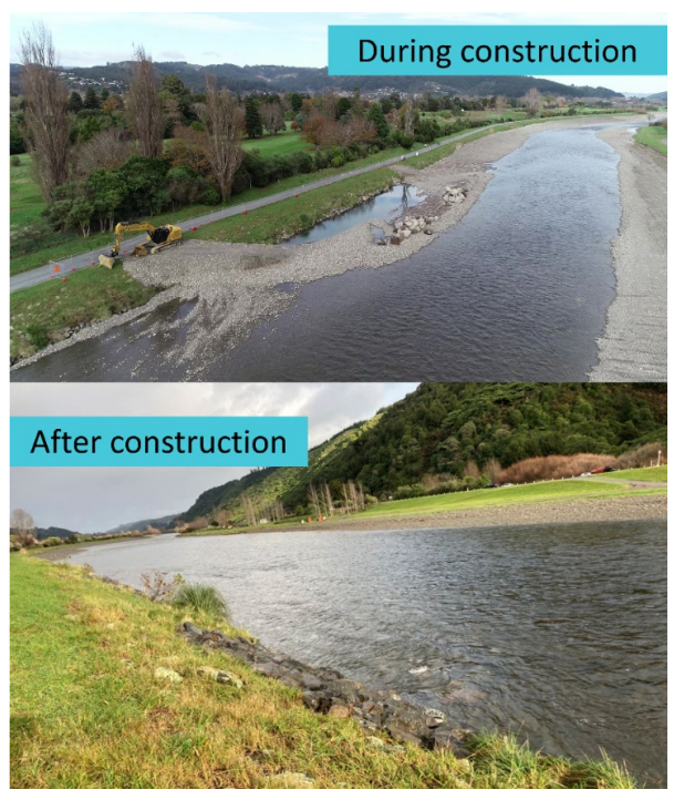
Figure 1: Royal Wellington Golf Club (North) Erosion Protection - Completed Mahi