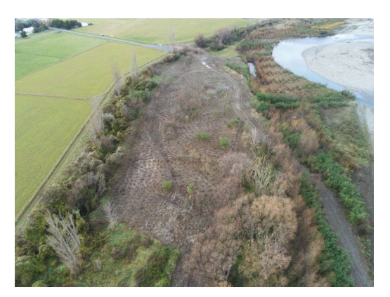
Figure 12 Drone footage after clearance works