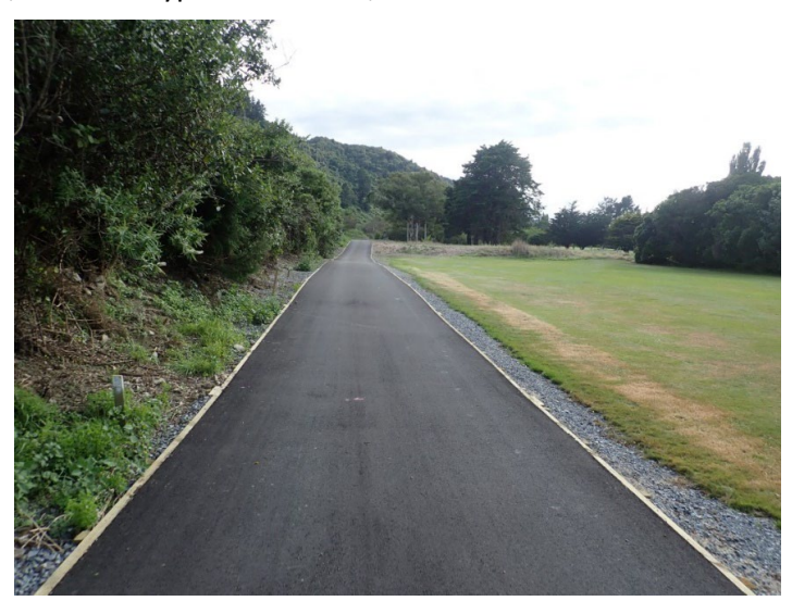
Figure 4: Manor Park Pedestrian and Cyclist Trail Construction - In progress Mahi