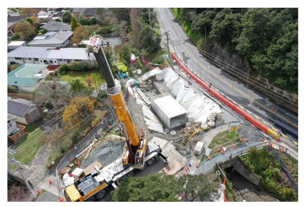
Figure 6: Pinehaven Culvert during construction