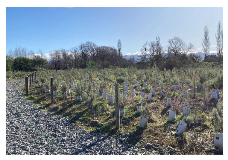
Figure 14 Photo taken July 2022, similar angle to photo above