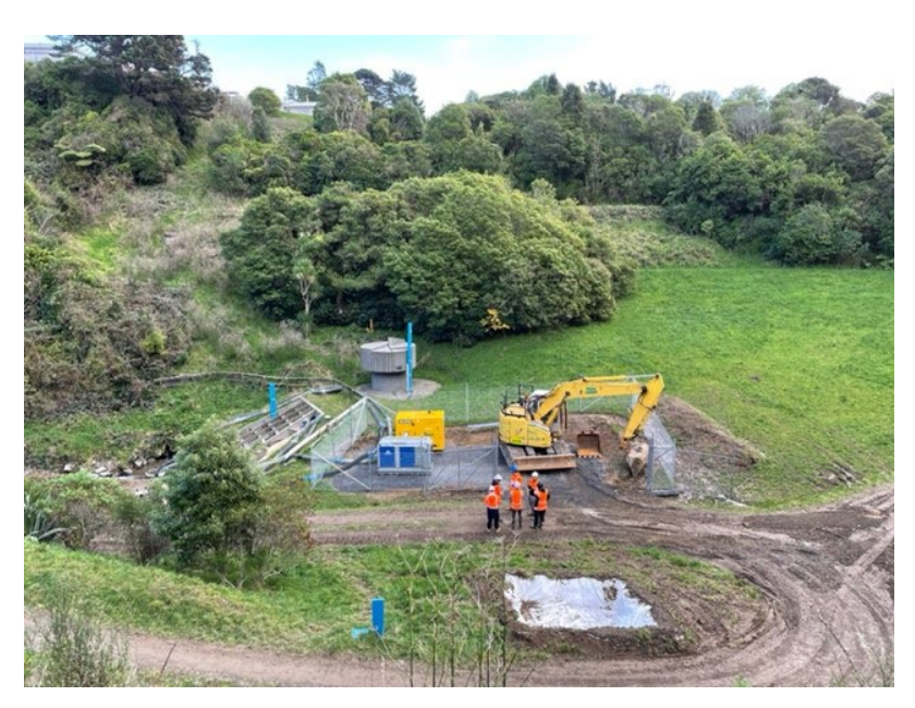
Figure 5: Seton Nossiter Culvert Repair - In progress Mahi