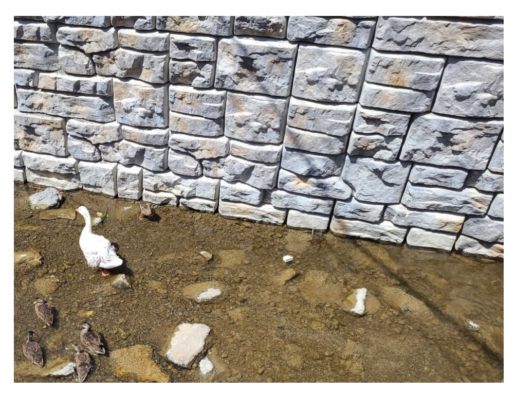
Figure 7 The Pinehaven Goose and some ducks enjoying the new Redi-Rock walls downstream of Pinehaven Culvert