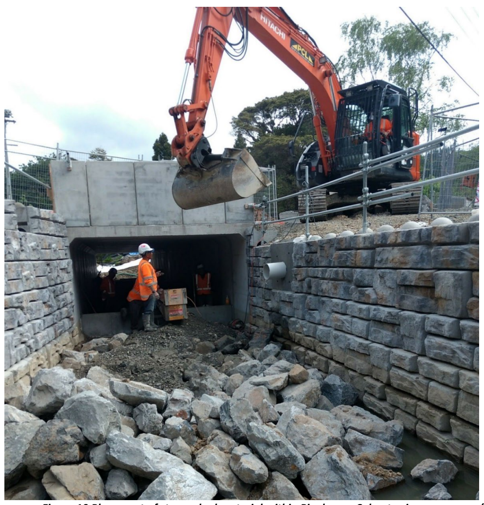
Figure 10 Placement of stream bed material within Pinehaven Culvert using conveyors