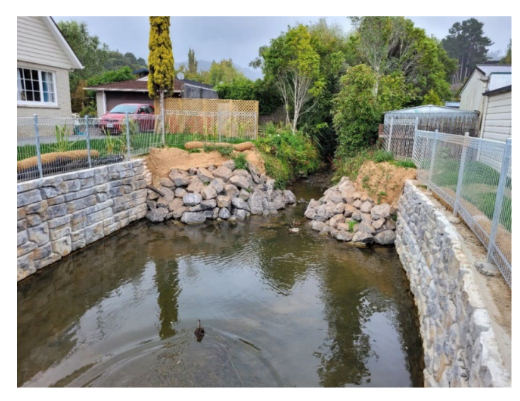
Figure 9 Redi-Rock walls and scour protection upstream of Sunbrae Culvert