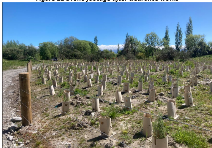
Figure 13 Photo taken October 2021