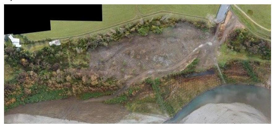
Figure 11 South Road, Masterton (2.3ha, 10,417 plants). Drone aerial taken just after clearance and before planting activities started August 2021

g Planning with contractors for site preparation and pest plant/animal control for winter 2023 are almost complete. This year the equivalent of 6.5 people were employed full-time.