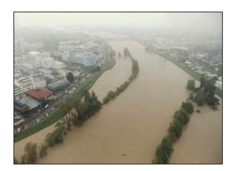
Figure 2: The Hutt River – Central Business District, October 1998