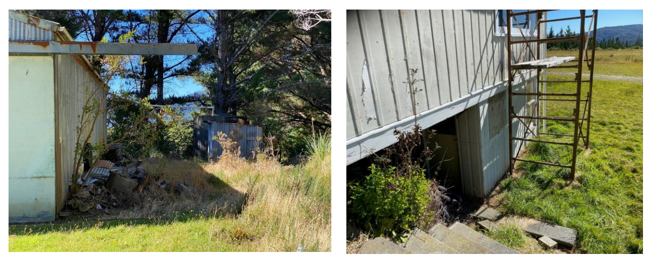
There is a generator shed beside the hangar. There is a storage room underneath the club hut, at full ceiling height.

All outbuildings are in poor condition. The Building Inspection report has photos and details.