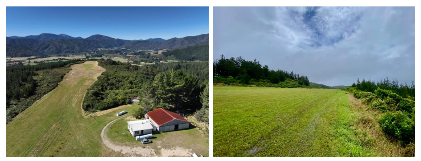
The former glider club licence area includes a runway and two club buildings. We are seeking interest in appropriate new of these buildings to enable them to be recycled and avoid demolition.

New uses must offer benefits to the park and align with the values and compatible uses and activities identified in our management plan for regional parks.