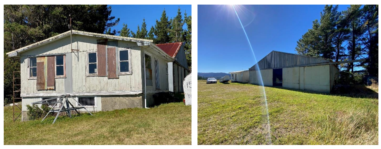
Former glider club hut and hanger. Both require extensive upgrade and consenting works before they can be reused for other compatible park purposes.