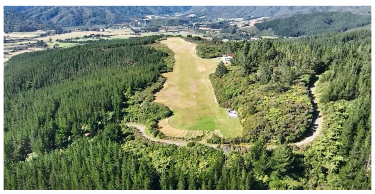
Former glider club runway open space and access track. There will be temporary disruption to access in future when the surrounding plantation forest is harvested.

We welcome your questions. Please email <u>parksplanning@gw.govt.nz</u> or come along to an open day if one is organised. You can also phone the Pākuratahi Park Ranger via our Contact Centre - 0800 496 734.